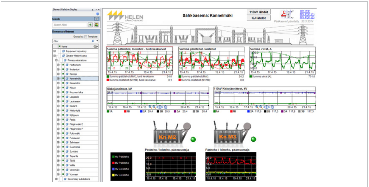
Helen Sähköverkko Oy uses the PI System to continuously display real-time process data in a customized dashboard.